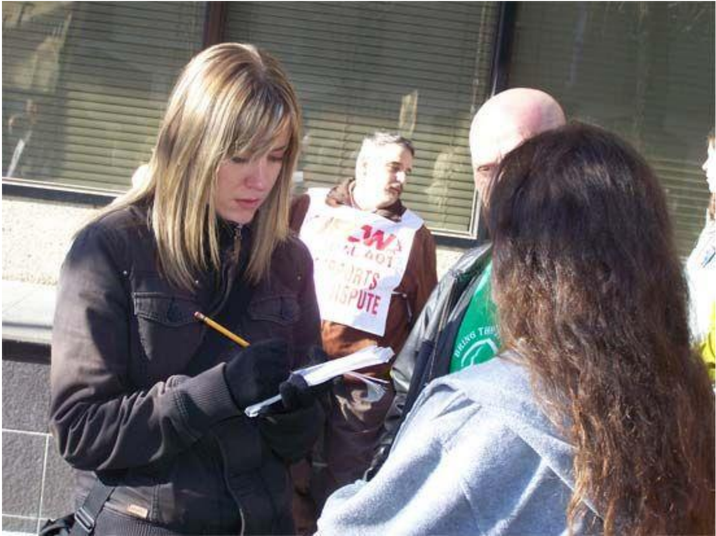
An interview for a newspaper story