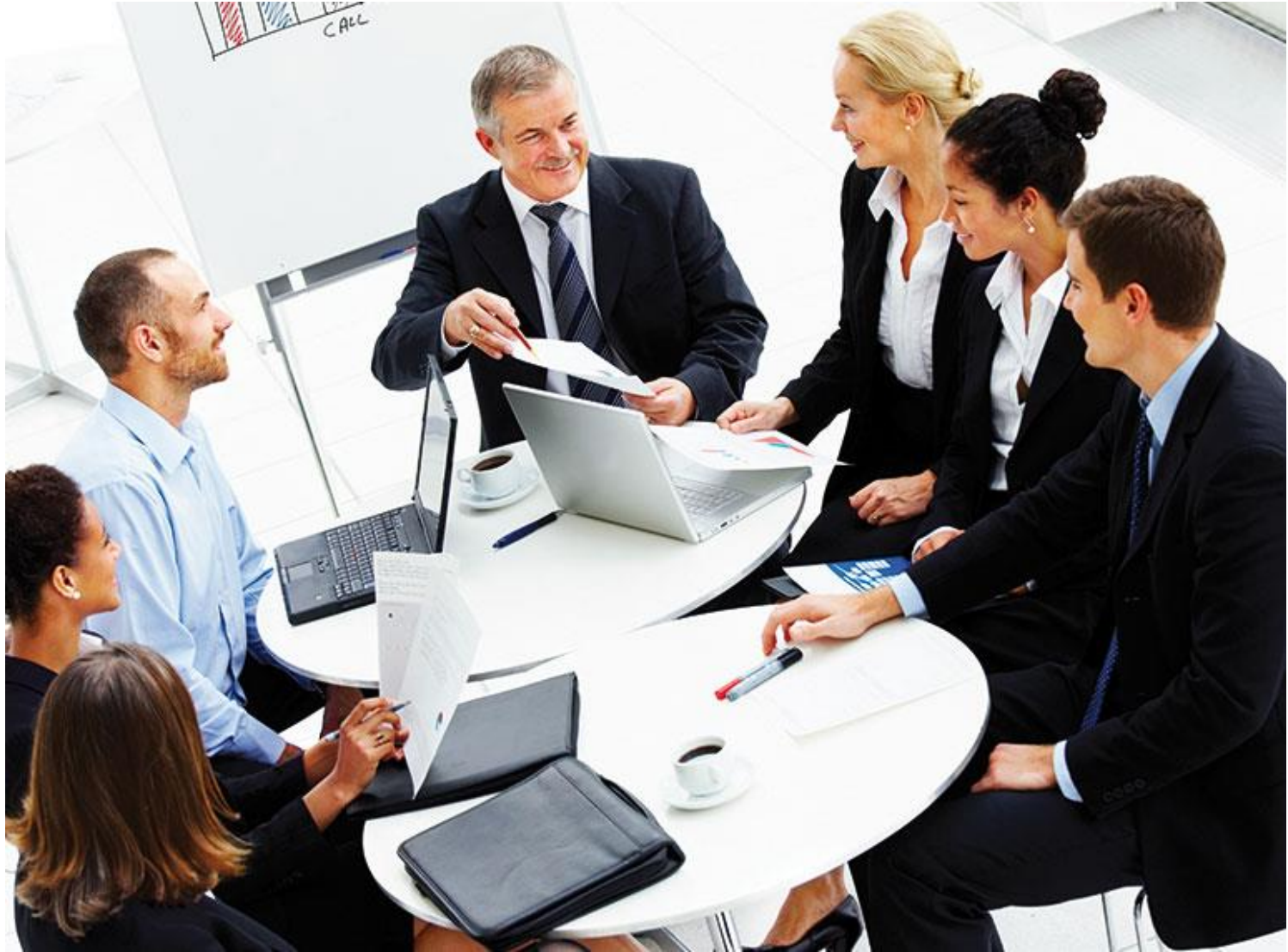
A business meeting