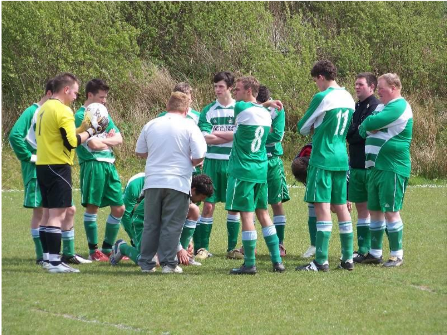
A half-time pep talk during a match