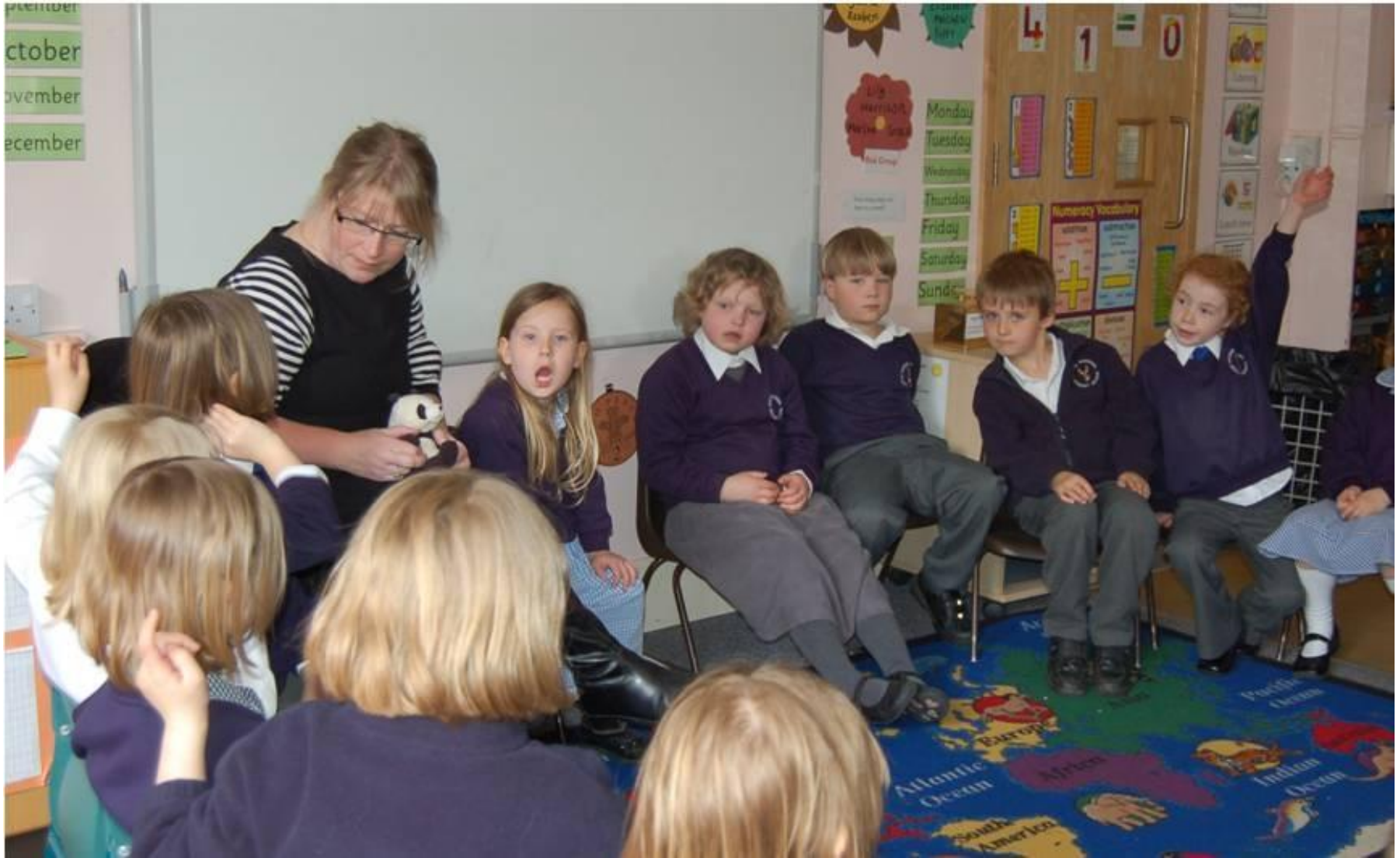
Circle time/ a philosophy for children discussion